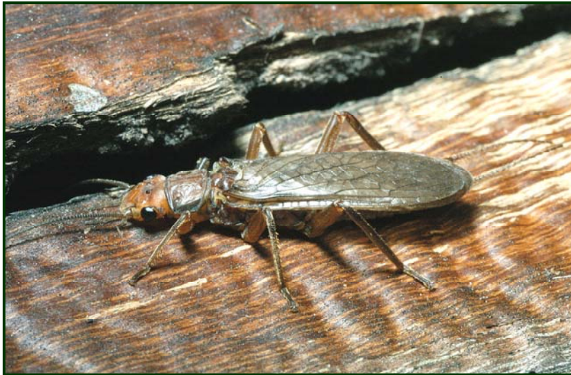
Hesperoperla pacifica (Banks)