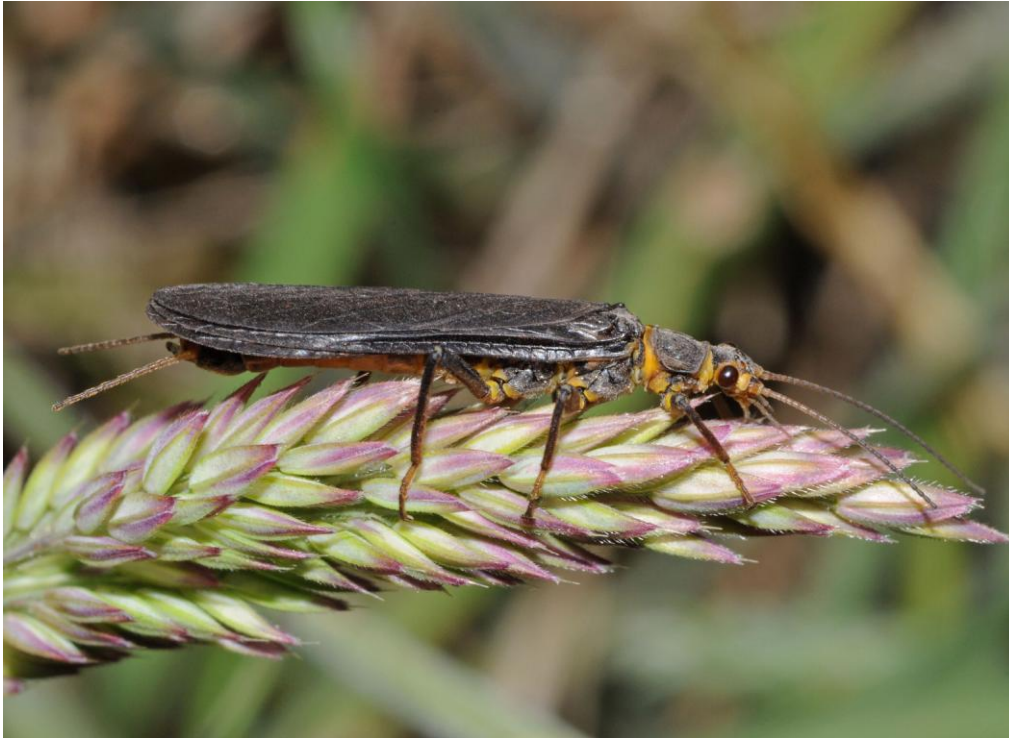
Pteronarcella regularis (Hagen), Mt. Shasta City Park, California, USA.