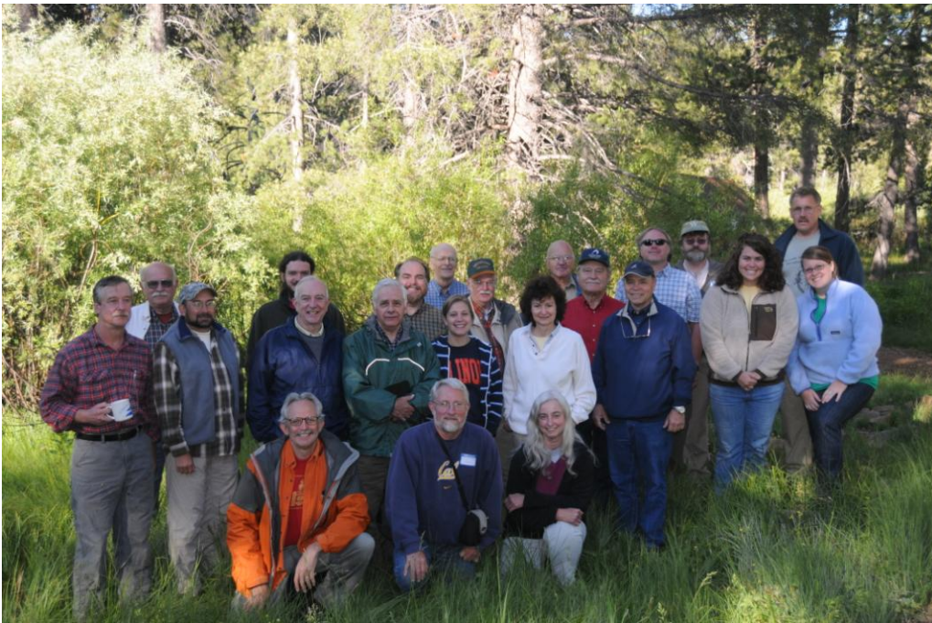
The group of familiar North American stonefly workers.