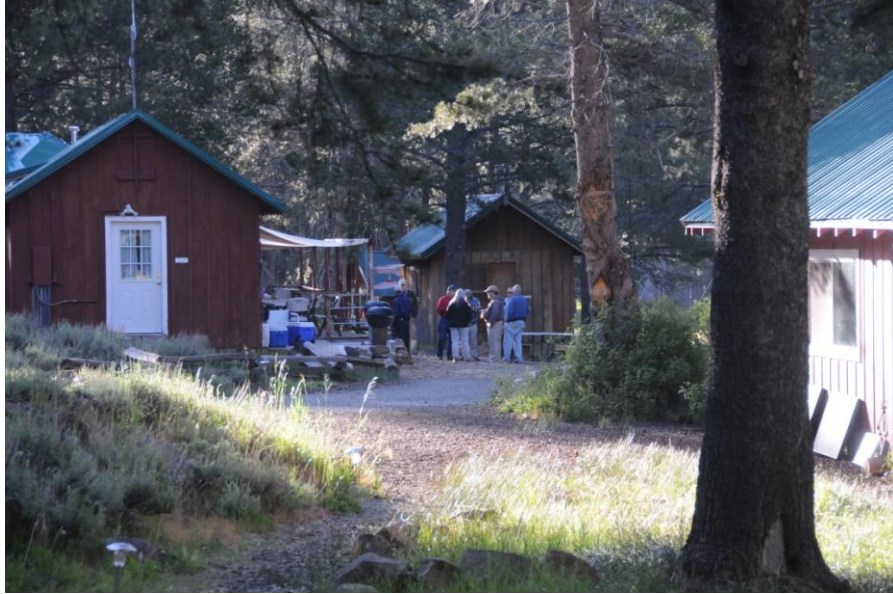
The rustic facilities at Sagehen Biological Station.