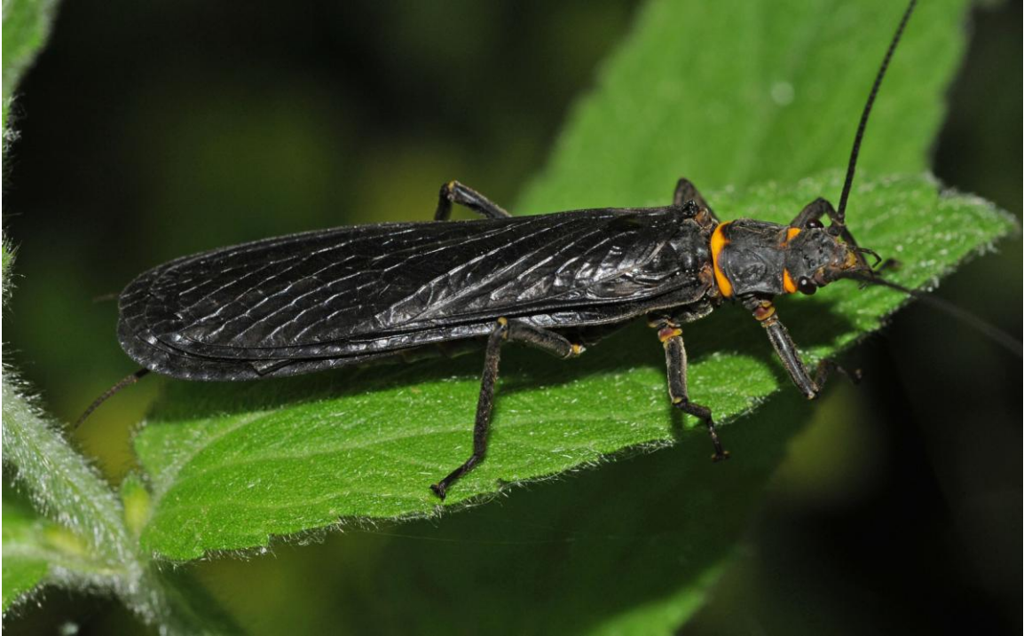
Pteronarcys princeps Banks, Mt. Shasta City Park, California, USA